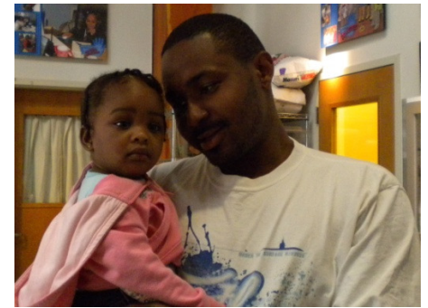
Guests staying with RAIHN over the last few months