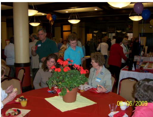
Guests at the celebration volunteer event