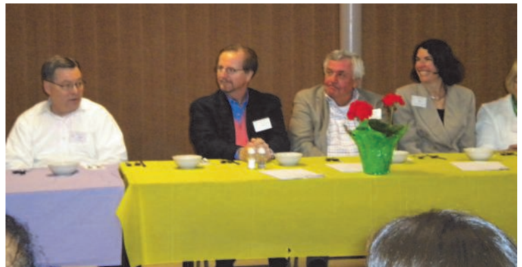
Above: Discussion amongst the guests.