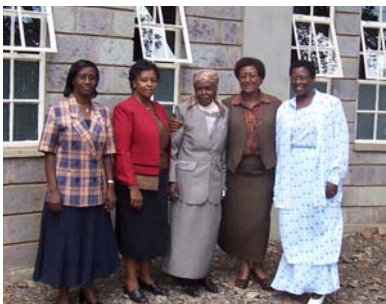
Women Elders at Kihumo Church