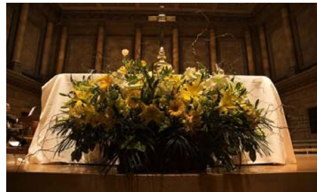
Easter Celebration at Kodak Hall April 4, 2010