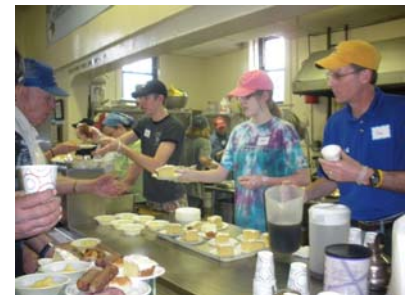
Easter Dinner at Cameron Community Community Ministries