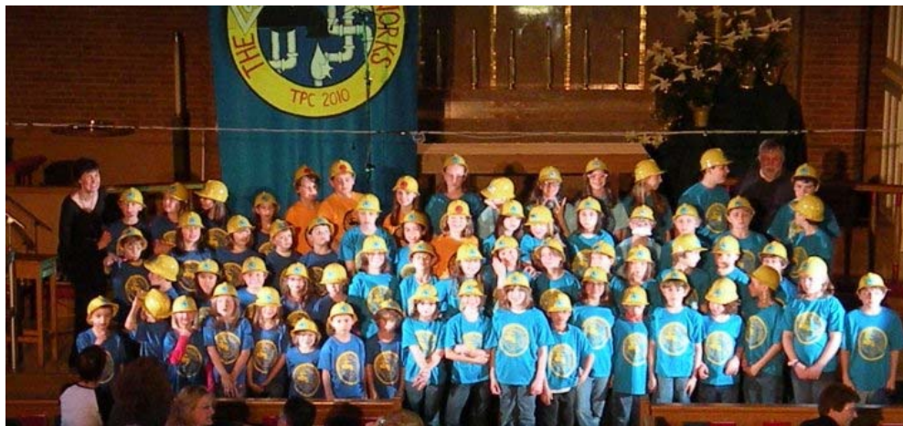
Cast of "The Living Water Works" April 11, 2010