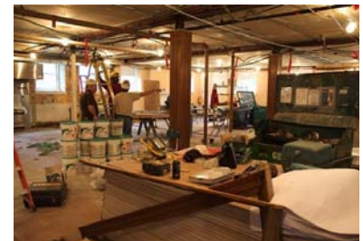
New Celebration Center Takes Shape