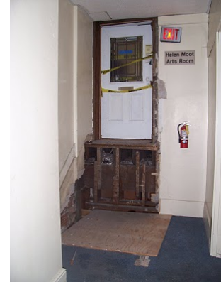
It’s a bit of a HOP to the Moot Room at the moment!

The signs are in place, the sanctuary, Johnston Hall and the lower level are official construction zones and hard hat areas. All areas have been gutted and protective plastic on the stained glass windows gives the scene a kind of “underwater” feel. There is mute testimony given by the wooden sub-floor—an arc that shows the shape of the original 1890’s chancel. There is much revealed about what has been, but with Johnston Hall with its ceiling open to the rafters, there is more—there is the promise of the shape of things to come.