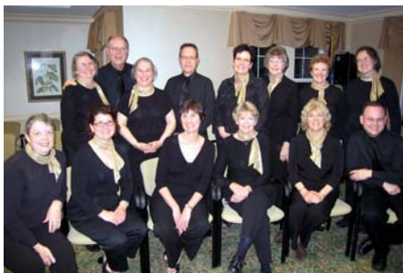
Third Church Ringers at Cloverwood May 2010

Note: Rally Day is September 12. Third Church will hold one service of worship on that Sunday, at 11:15 a.m., in the Incarnate Word Sanctuary, followed by Rally Day festivities on the Third Church lawn. Our "program year" schedule will resume on September 19 – 9:00 a.m. worship in the Third Church Chapel and 11:15 a.m. at Incarnate Word.