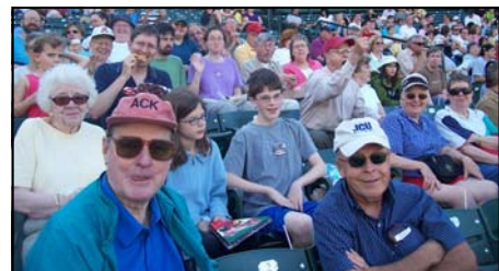
Join us for the Red Wings Game on Friday, June 18 at 7:05. See page 3 for details!