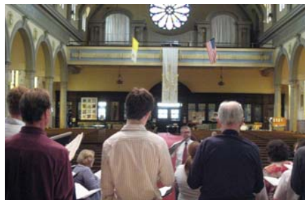
Chancel Choir Rehearses for Concert at St. Andrew Church, May 2, 2010