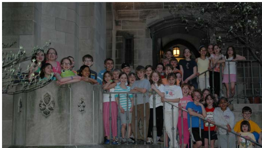
The Junior Choir, East Liberty Presbyterian Church, Pittsburgh, Pennsylvania April 20-22, 2007

This enthusiastic group of children, along with leaders and parents, left Friday, April 20 for Pittsburgh, Pennsylvania. Their first evening was spent in Erie, Pennsylvania and then they continued to Pittsburgh where they sang a concert at Canterbury Place, a retirement community, and then on Sunday morning sang during worship at East Liberty Presbyterian Church. The children conducted several fundraisers and congregational support made this wonderful experience for them possible.