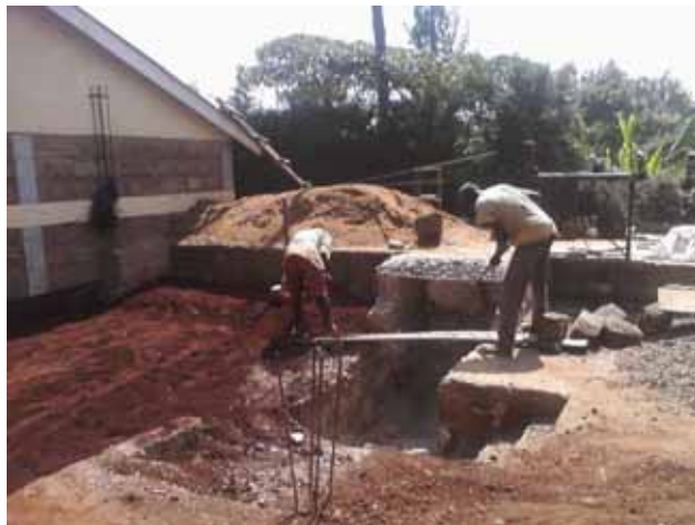
Workers digging foundations and sewers for new bathrooms at the Kihumo Head Start school

Poor Kenyan pre-school children have the same problem as poor American children. When they arrive for their first day of elementary school, they are already three years behind the families of educated parents.