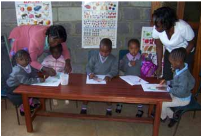
First enrollees and teachers in the Kihumo Head Start program sponsored by Third Church Capital Campaign