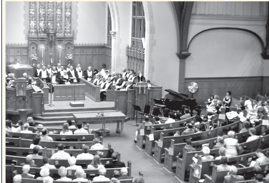
Third Church Family in Worship

“Christian worship joyfully ascribes all praise and honor, glory and power to the triune God. In worship the people of God acknowledge God present in the world and in their lives. As they respond to God’s claim and redemptive action in Jesus Christ, believers are transformed and renewed. In worship the faithful offer themselves to God and are equipped for God’s service in the world.”